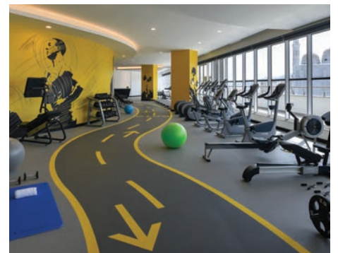
24/7 Fully-equipped Gym

With modern décor throughout and an abundance of space, Fraser Suites Muscat is exceptionally well appointed. A roof top swimming pool, boutique shopping arcade, and a ballroom for up to 800 people are just some of the highlights. Naturally, there is a 24-hour gym, as well as a spa, outdoor garden with a children's play area and a convenient, all-day dining restaurant.