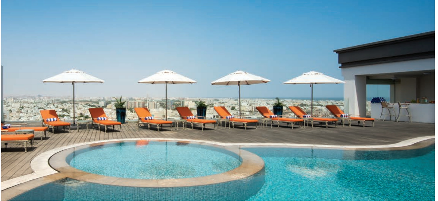
Rooftop Swimming Pool